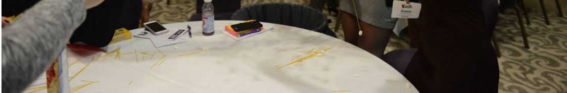
Students working on a communication exercise at the IGNITE Leadership Conference