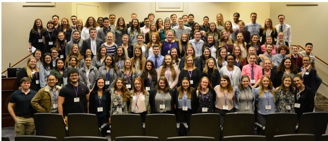
Students participating in the IGNITE Leadership Conference

These experiences are designed to provide you with the skills you'll need to succeed after graduation, while allowing you to network with fellow first-gen students and staff!