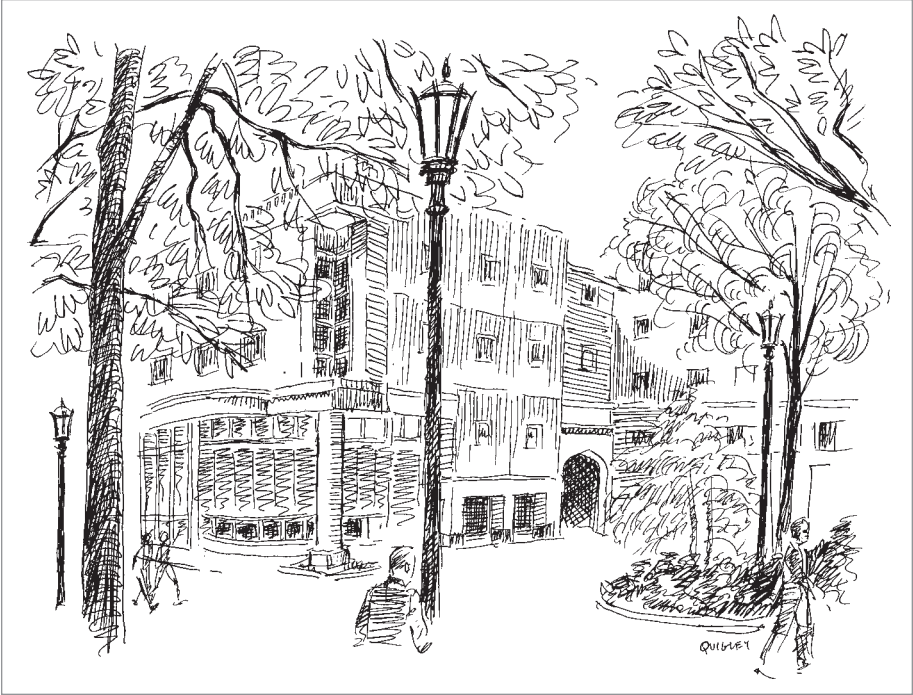
Weinberg Memorial Library