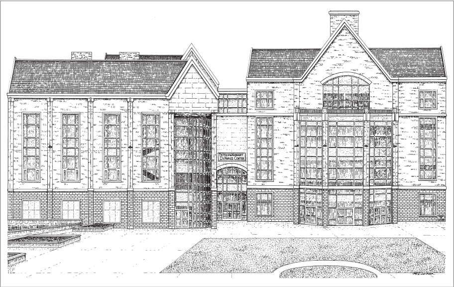
Patrick & Margaret DeNaples Center