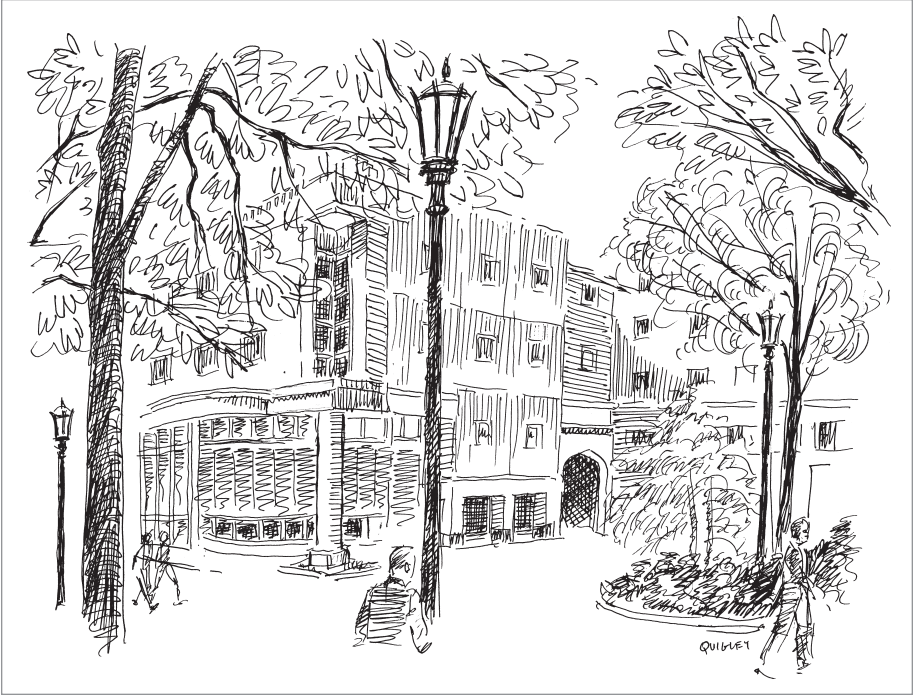
Weinberg Memorial Library