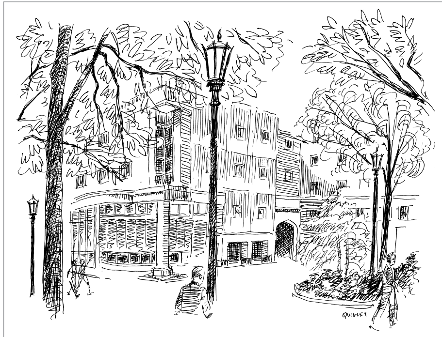
Weinberg Memorial Library