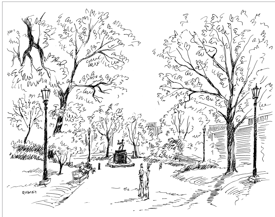
The Royal Way