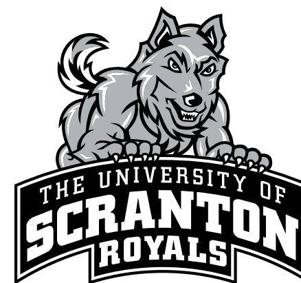
The University's mascot, the Royal Wolf.

The University is widely regarded for its tradition of excellence on both the national and regional level. Scranton has won three NCAA Division III national titles, two in men's basketball (1976, 1983) and one in women's basketball (1985), while the men's soccer team has advanced to the Final Four four times, including championship match appearances in 1980 and 1981. The women's soccer team has played in the NCAA tourna-