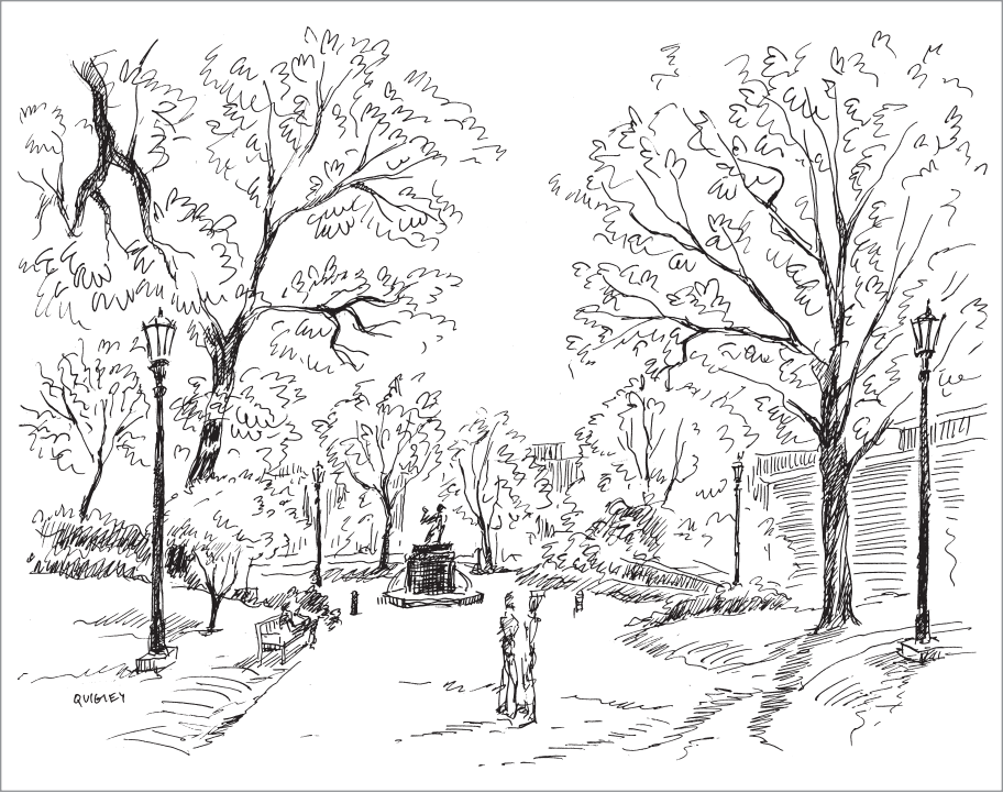
The Royal Way