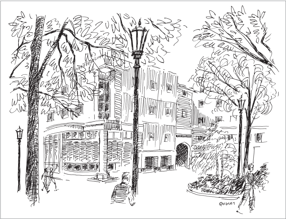
Weinberg Memorial Library