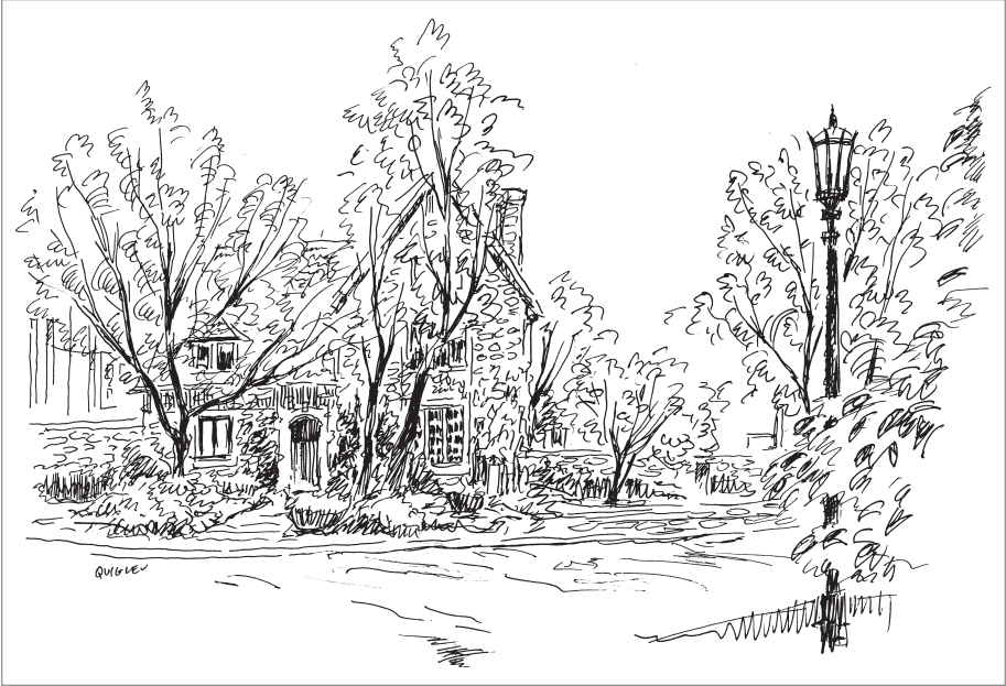
Rupert Mayer House