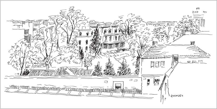
Aerial view of the Scranton Estate grounds