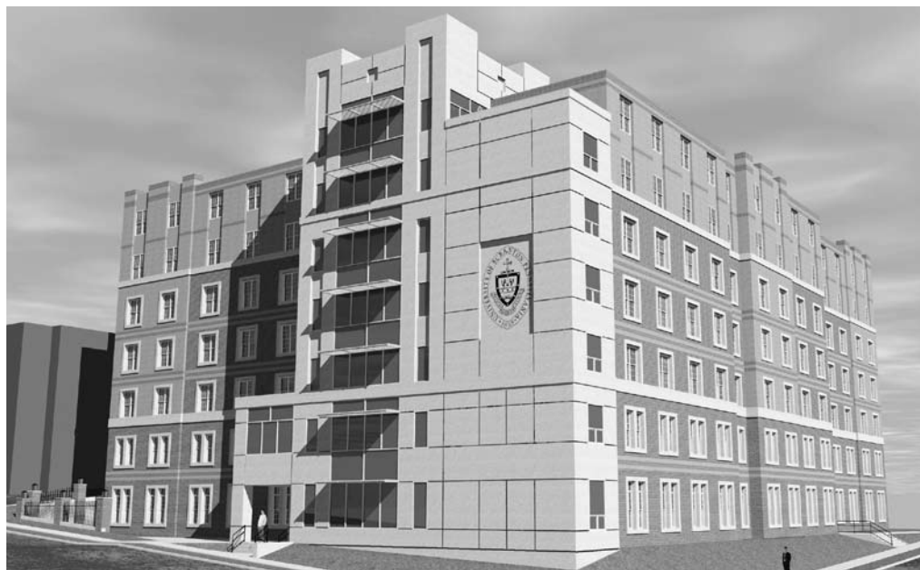
The University will break ground on Thursday, Sept. 6, at 10 a.m. for a new 386-bed residence hall. The building is scheduled for completion in the fall of 2008.