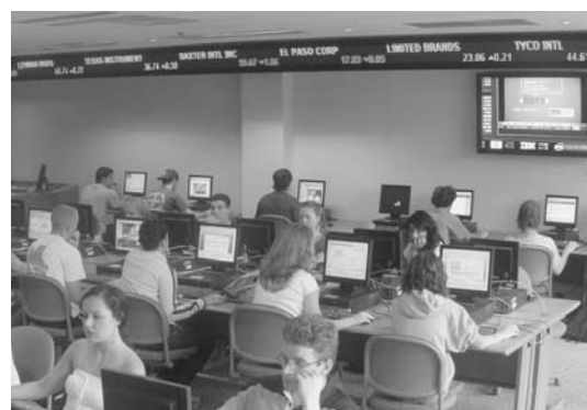
The new Alperin Center simulates a Trading Floor, complete with an electronic ticker and other news and data displays.

Business students at Scranton are getting hands-on experience with the stock market, thanks to the new Irwin E. Alperin Financial Center on the main floor of Brennan Hall. The Center simulates a Trading Floor, complete with an electronic ticker and other news and data displays. When complete, students will be able to experience professional applications of the stock market through market simulations, in areas such as portfolio construction and risk management.