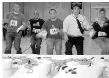
Participants race to collect office supplies during Dunder Mifflin Infinity's Office Olympics, held in the Byron Complex.