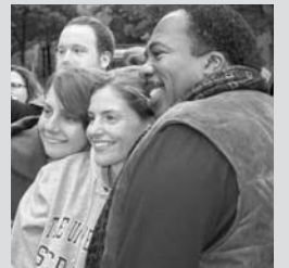
Leslie David Baker (Stanley) poses with Scranton students during NBC's Today show, Oct. 26.

It clearly caught the attention of Leslie David Baker, who plays Stanley on the Emmy award-winning sitcom, The Office .