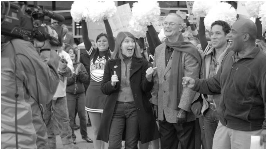
The Royals Cheerleaders cheer on "Office" cast members Kate Flannery (Meredith), Creed Bratton (Creed) and Oscar Nuñez (Oscar), and NBC's Al Roker during a live broadcast of the Today show from campus on Oct. 26.

In many ways, the Office Convention was much like the Emmy-award winning sitcom The Office . No one could have predicted the magnitude of its success.