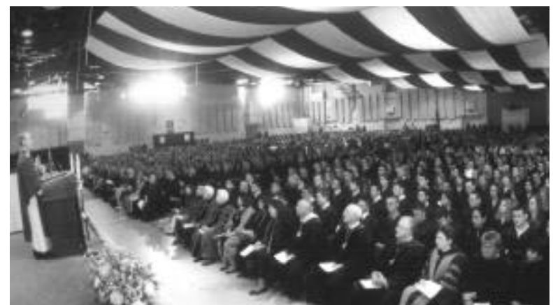
Graduates and their families filled the Byron Recreation Complex for the Baccalaureate Mass on May 29.