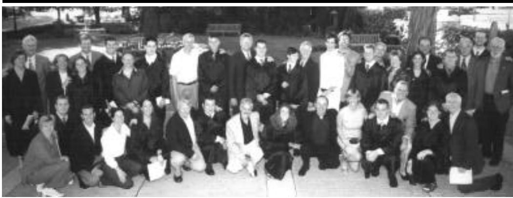
University of Scranton alumni whose children are members of the graduating Class of 2004 gathered in the Rose Garden on campus for this Scranton legacy photograph.