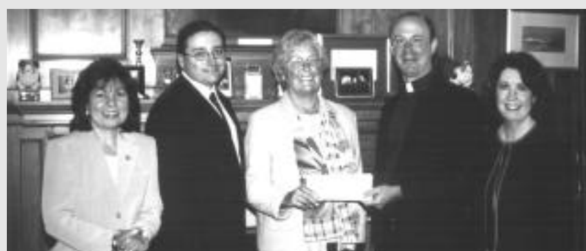
Scranton Area Foundation Supports University of Success

Ninety percent of the graduates employed full-time are working in Pennsylvania, New Jersey and New York. Fifty-six percent work in Pennsylvania.