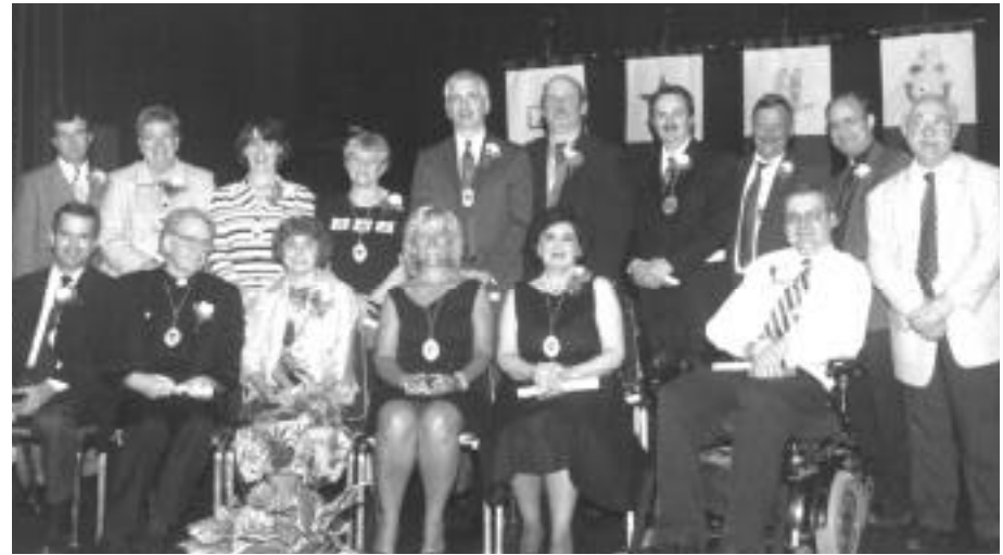
Employees with 20 years of service were recognized at an awards dinner on May 21.