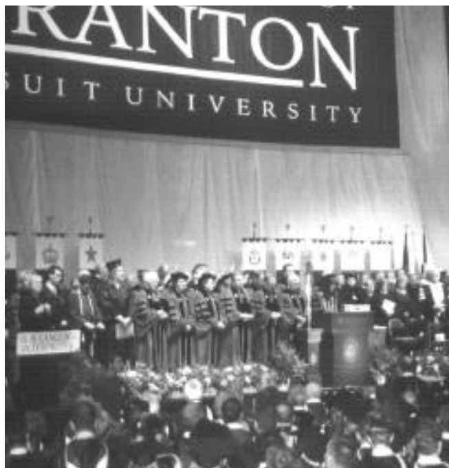
The University awarded 1,044 bachelor's, master's and associate's degrees during its 104th Commencement.