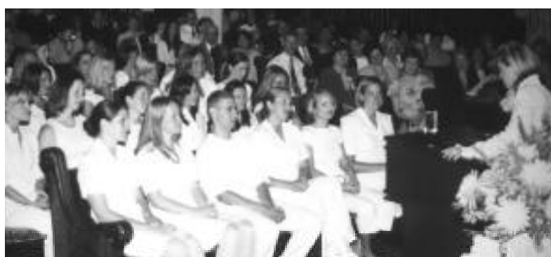
A Nursing Pinning Ceremony was held in the Houlihan-McLean Center on May 29.