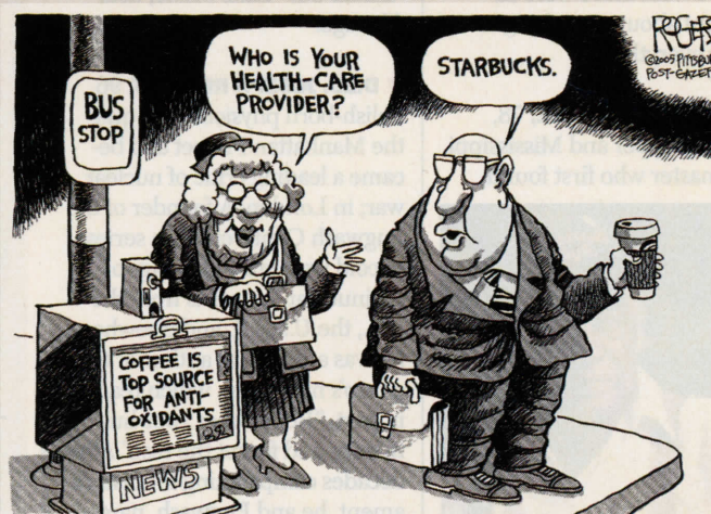
ROB ROGERS—THE PITTSBURGH POST-GAZETTE