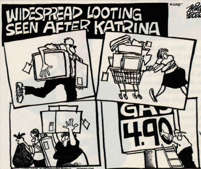
MIKE PETERS—DARTON DAILY NEWS/KNING FEATURES SYNDICATE