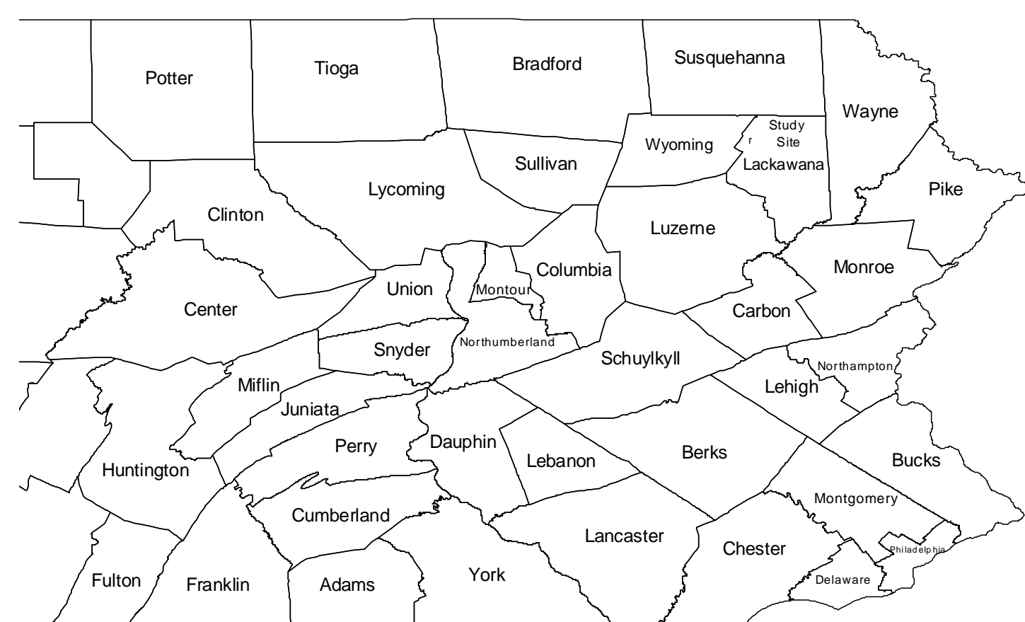
Figure 1. Study sites were in Northeastern Pennsylvania, Lackawanna County.

Mist-netting - We ran 2 banding sites, capturing landbirds in nets (forest n=22; shrub n=25) checked at 30 minute intervals. Forest nets included stacked 'high' nets elevated into the canopy. For each individual we recorded capture date and time, species, age and sex where possible (Pyle 1997. Identification guide to North American birds. Slate Creek Press), mass, and wing, tail and tarsus length. All birds were banded with a USGS aluminum leg band and recaptures measured without reference to previous records.