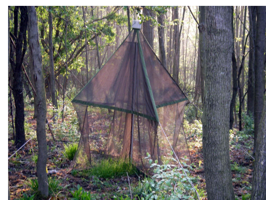
Figure 2. Malaise Trap for sampling flying arthropods.