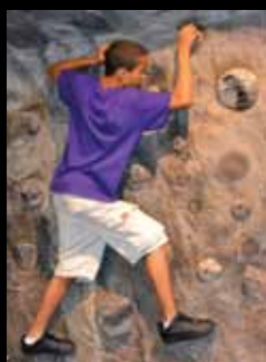
UNIVERSITY OF SUCCESS