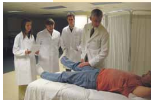
DPT students assist in evaluation, intervention and documentation of physical therapy patients at the Leahy Center.

The physical therapy service at The Leahy Community Health and Family Center benefits the local community, the university, faculty and students. Services are provided for those who otherwise would go without, faculty members have the opportunity to maintain clinical skills, and students gain practice experience with faculty mentors. This makes a stronger Department of Physical Therapy and a stronger University of Scranton.