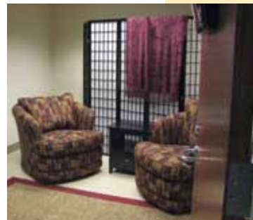
Presently, the medical clinic and the counseling clinic share space.

Consistent with cura personalis the clinic values the whole person. Growth occurs and lives are changed. The community, students and clients win.