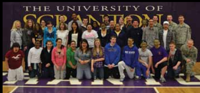
UNIVERSITY OF SUCCESS