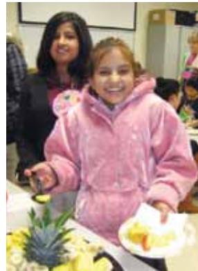
The Peacemakers Program assists primary-age school children in conflict resolution and conflict avoidance.

PEACEMAKERS is collaborative, inter-generational learning that models respect for "all persons" and the "whole person".