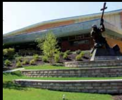
JOHN J. LONG, S.J. CENTER