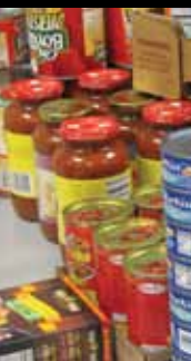
FOOD AND CLO