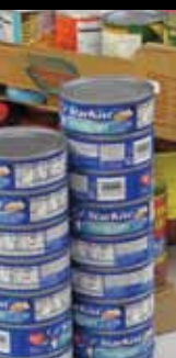
FOOD BANK CLINIC