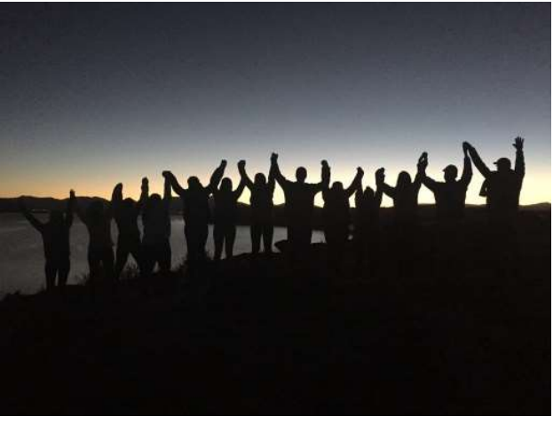
TRAVELING FROM ONE WORLD'S BELLY BUTTON (THE USA), TO ANOTHER WORLD'S BELLY BUTTON (CUSCO), TO LEARN ABOUT HEALTH

Cusco or Qosqo , like many other names of locations throughout the world, means "the world's belly button", or the center of the world, in Quechua. It is a beautiful colonial city in the heart of the Andes and the former capital of the Incan empire. This summer, Cusco was also the Study Abroad destination for 15 students from the University of Scranton who registered for Spanish classes as well as the course "Perspectives of Health, Healthcare, and Well-Being in Latin America".