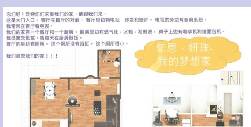
Sample Student Work on homestyler pictured above.

"The collaborative project had us research traditional Chinese culture, immersing us in the culture. This helped us to learn more about China as a whole and not just about the language." Lai's paper "Using Online Platforms to Promote Collaborative Learning in a Foreign Language Class" will be published in Florida Foreign Language Journal, Issue 13, 2017.