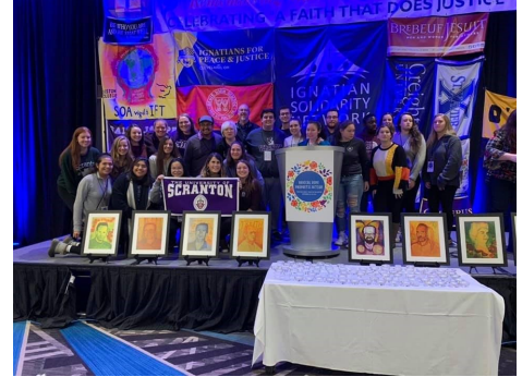
Scranton contingent at IFTJ

Two dozen University students and chaperones traveled to DC in November to gather in the context of social justice and solidarity to learn, reflect, pray, network, and advocate together at the Ignatian Family Teach-In for Justice. Through the Ignatian Global Citizenship Program (IGCP), the Political Science Department sponsored the attendance for seven Political Science and International Studies majors. Students also descended upon Capitol Hill to lobby their members of Congress to support comprehensive and humane immigration reform.