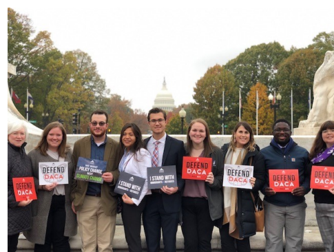
Advocacy Day on Capitol Hill