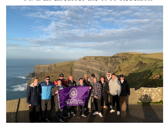
Scranton contingent in Ireland