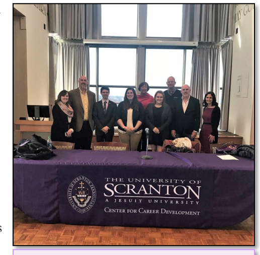
April Alumni Panel