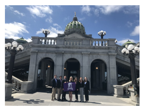
Recent Alumni attend some of the best Graduate & Law Schools