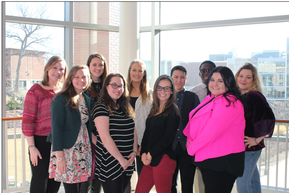
JKWC Staff Members