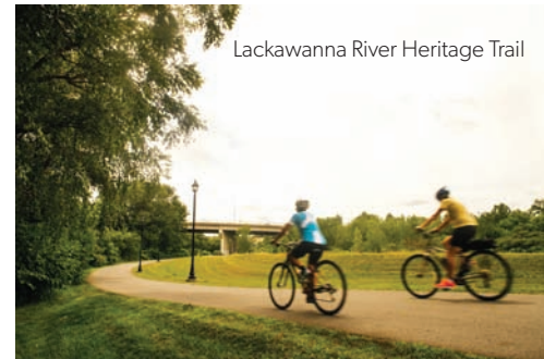
Lackawanna River Heritage Trail

***Please do not use the bike sharing program as a way to get to class. Bicycles must be returned to the library before closing.