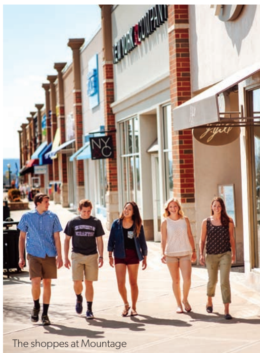
The shoppes at Mountage

A 15-minute bus ride from campus sits the Dickson City shopping area. Over 50 retailers, including Macy's, Walmart, Target, J.C. Penny, and GAP lie within 5 minutes of each other. The main hub of the shopping area is the Viewmont Mall, where you can easily catch a bus to other shopping plazas in the area.