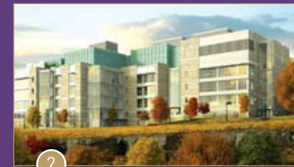
2 Unified Science Center • Phase I to Be Completed Fall 2011