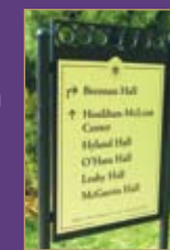
8 Campus Signage • Completed May 2010