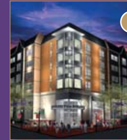
3 Apartment & Fitness Complex on Mulberry St. • To Be Completed Fall 2011