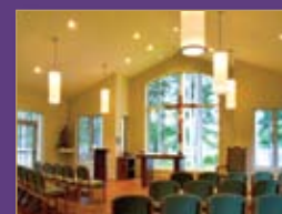
7 Retreat Center at Chapin Lake & Peter Faber, S.J., Chapel (Expansion & Renovation) • Dedicated Nov. 2006