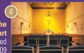
4 Chapel of the Sacred Heart • Dedicated Aug. 2009