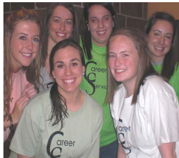
Marketing Committee Members

The Career Services Marketing Committee hosted Quizzo on Friday, April 15th in the DeNaples Center on first floor cafeteria. Also helping out were the Career Services work study students. Quizzo is a game that offers students the chance to form teams and answer various trivia ques-