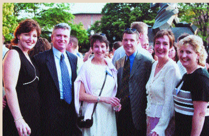
Classmates on the Commons: Members of the Class of 1987 renew their 15-year friendships during Reunion.

Members of the 50th-year Reunion class gather in the lobby of the Long Center during Reunion festivities in June. The group celebrated its milestone and the culmination of a five-year-long effort to establish a Class of 1952 Scholarship – the first 50th-reunion scholarship at The University of Scranton.