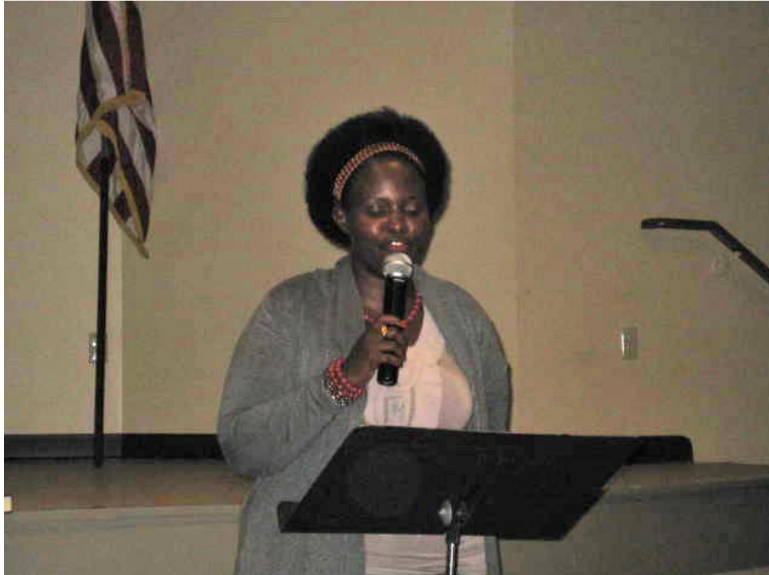
Role of Women in Rwanda Lecture