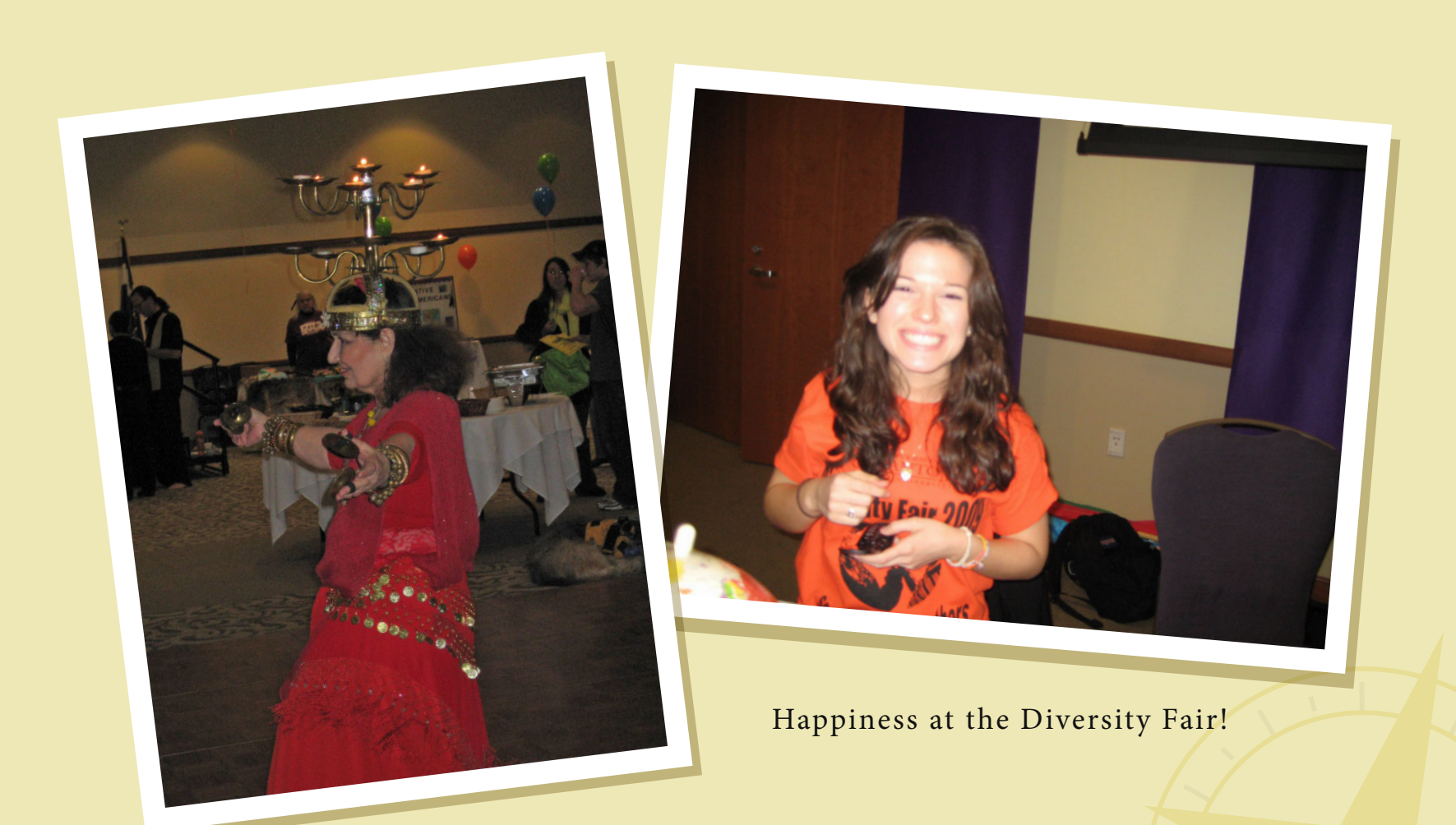
And making music too!