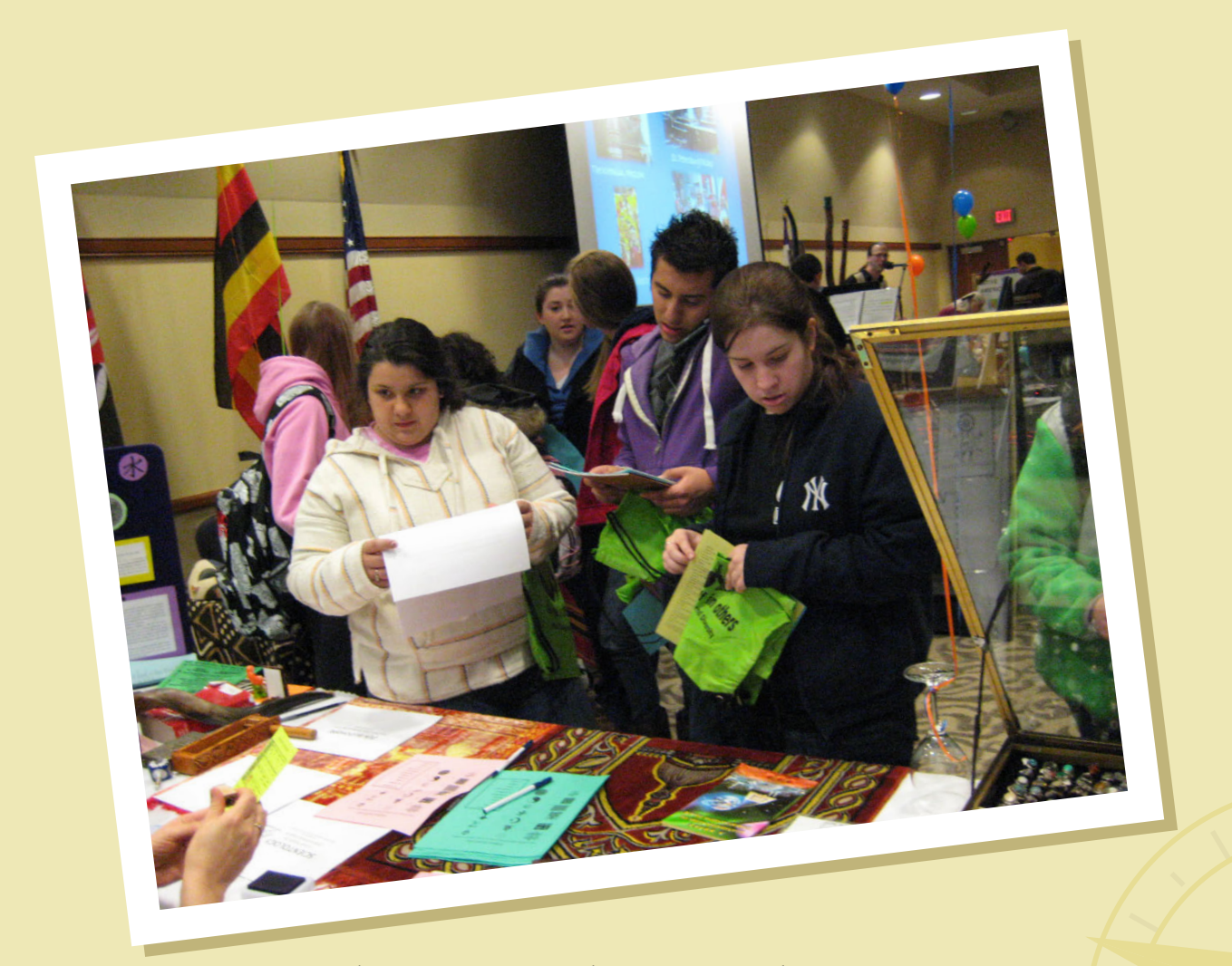
Taking a quiz and stamping that Passport.