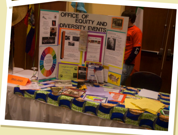
The Office of Equity and Diversity is full of information and hosts the BEST events!