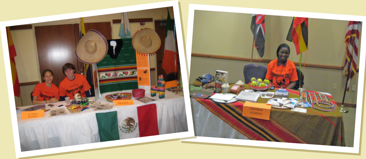
Mexican Culture "Day of the Dead"