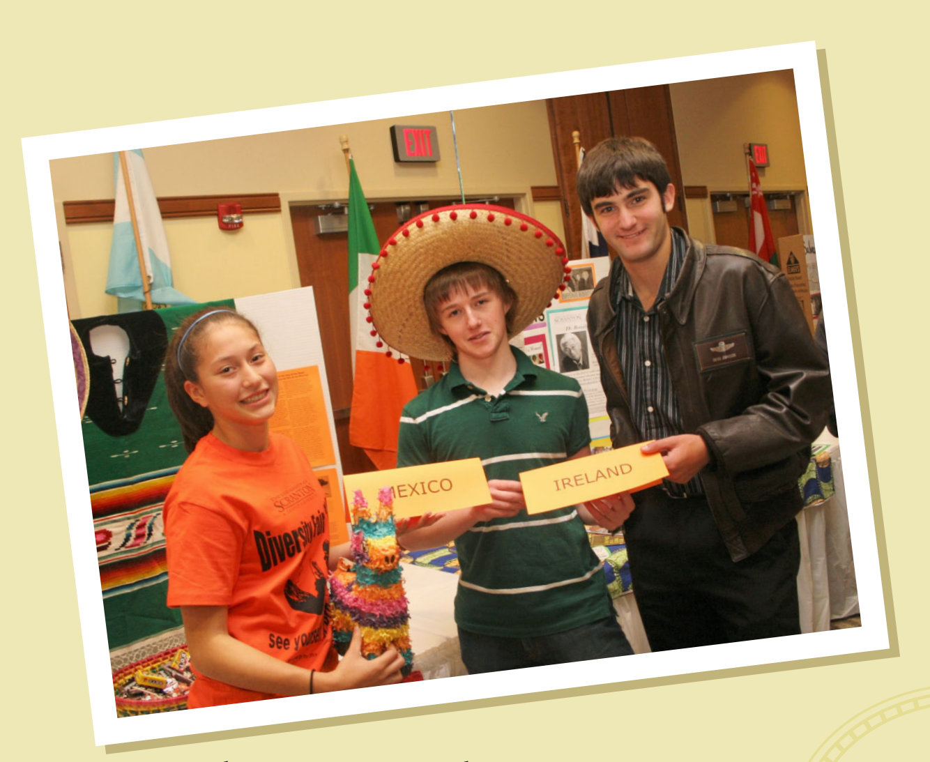
Welcome to Mexico! Olay!