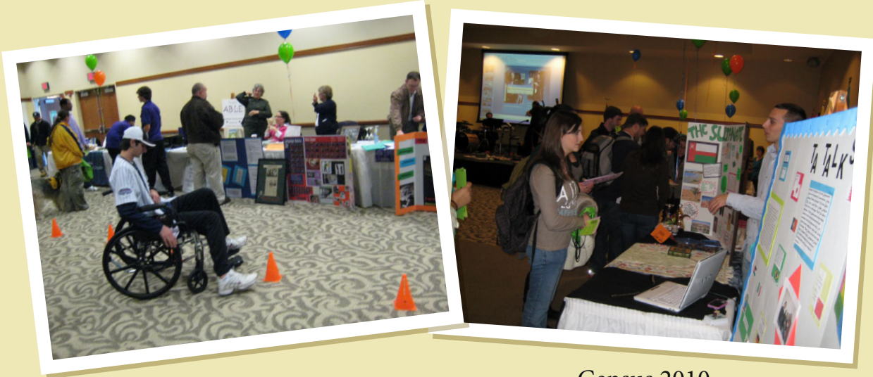
NEPA Center for Independent Living: "Project Able"