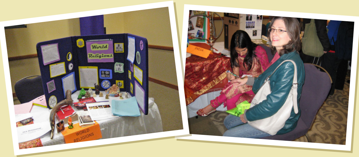
Religions of the World