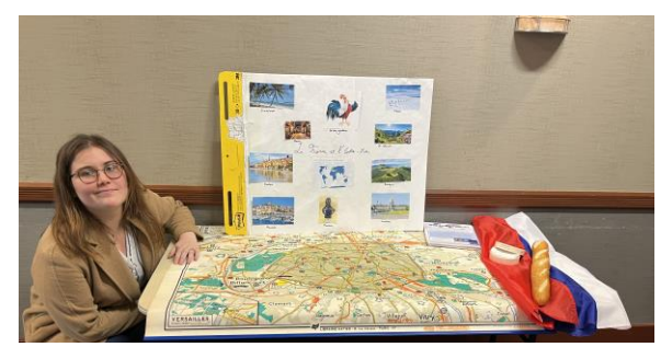
Heloise Verissi, French FLTA, next to French map, poster, and traditional French cuisine.

how languages create opportunities for engagement with other cultures and communities around the world. Languages open doors to other people, other opportunities, and ultimately, other worlds, and this event aimed to inspire students to continue learning languages and exploring other cultures.