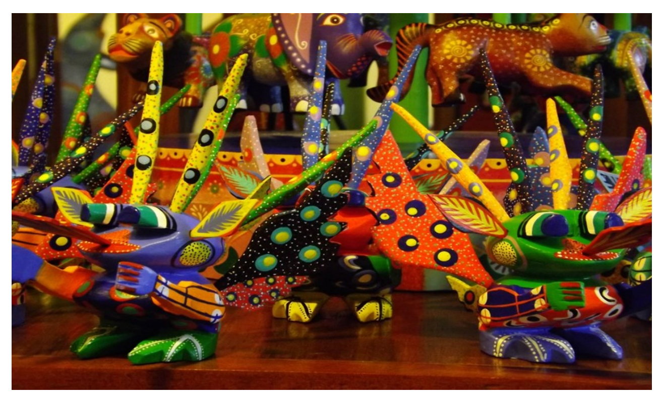
Latin American Film Festival Fall 2016